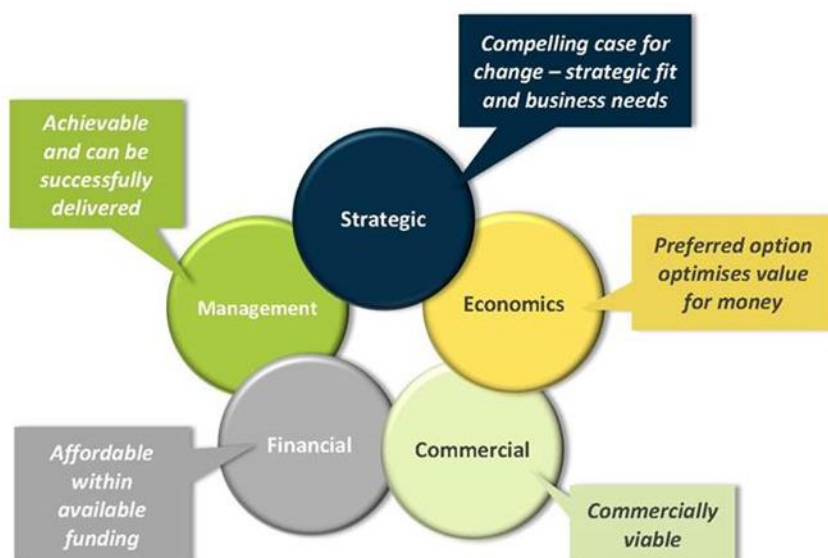
Figure 1: The Better Business Case Approach

The aim of the approach is to provide objective analysis and consistent information to decision-makers, enabling them to make smart investment decisions for public value. 1 It is an ideal tool for the public sector to make long-term decisions regarding service delivery. It looks at financial measures but in a weighted, balanced context with four other factors (strategic, economic, commercial and management) as detailed in Figure 1.