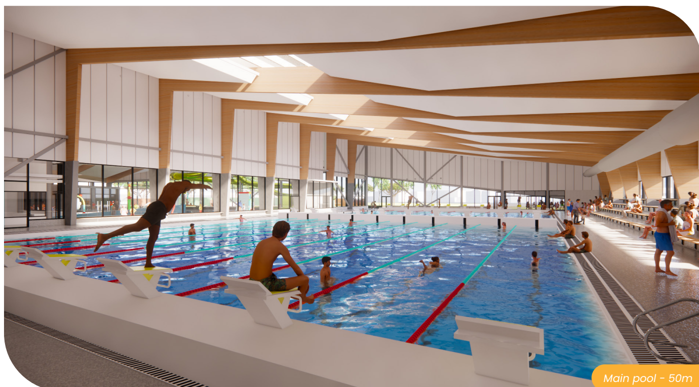
Main pool - 50m