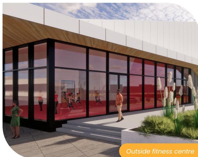
Outside fitness centre

We are unable to build a facility to accommodate all aquatic events as other facilities in New Zealand have been designed for these large-scale events. Some aquatic sports like diving will not be able to be held in the future facility. We have looked at budget, finding the balance between community, sports, and sustainability, while also taking the wider view of how the Naenae Centre fits within the wider regional and national aquatic facility network.