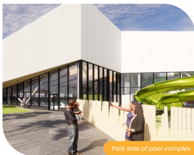
Park side of pool complex