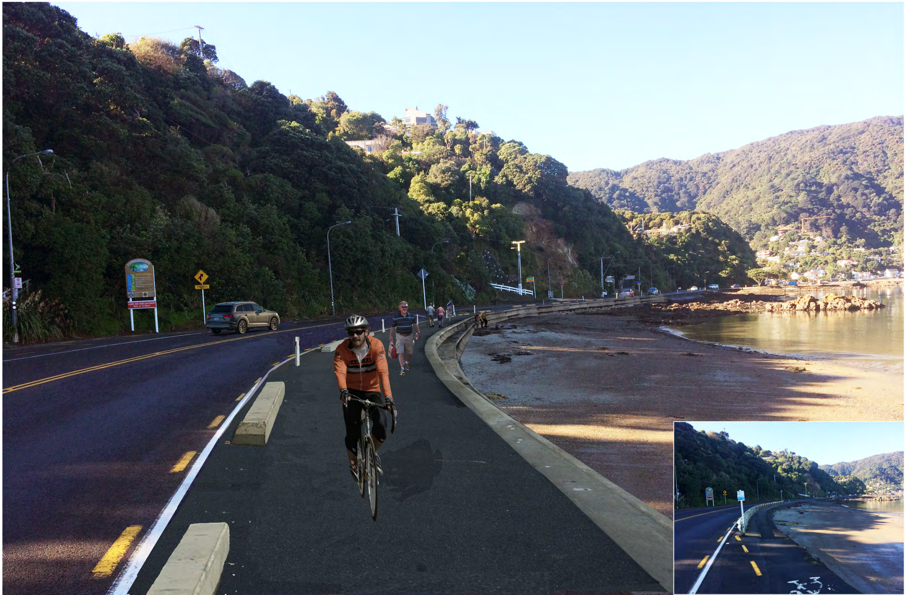
Simulated view of proposed 3.5m wide shared path