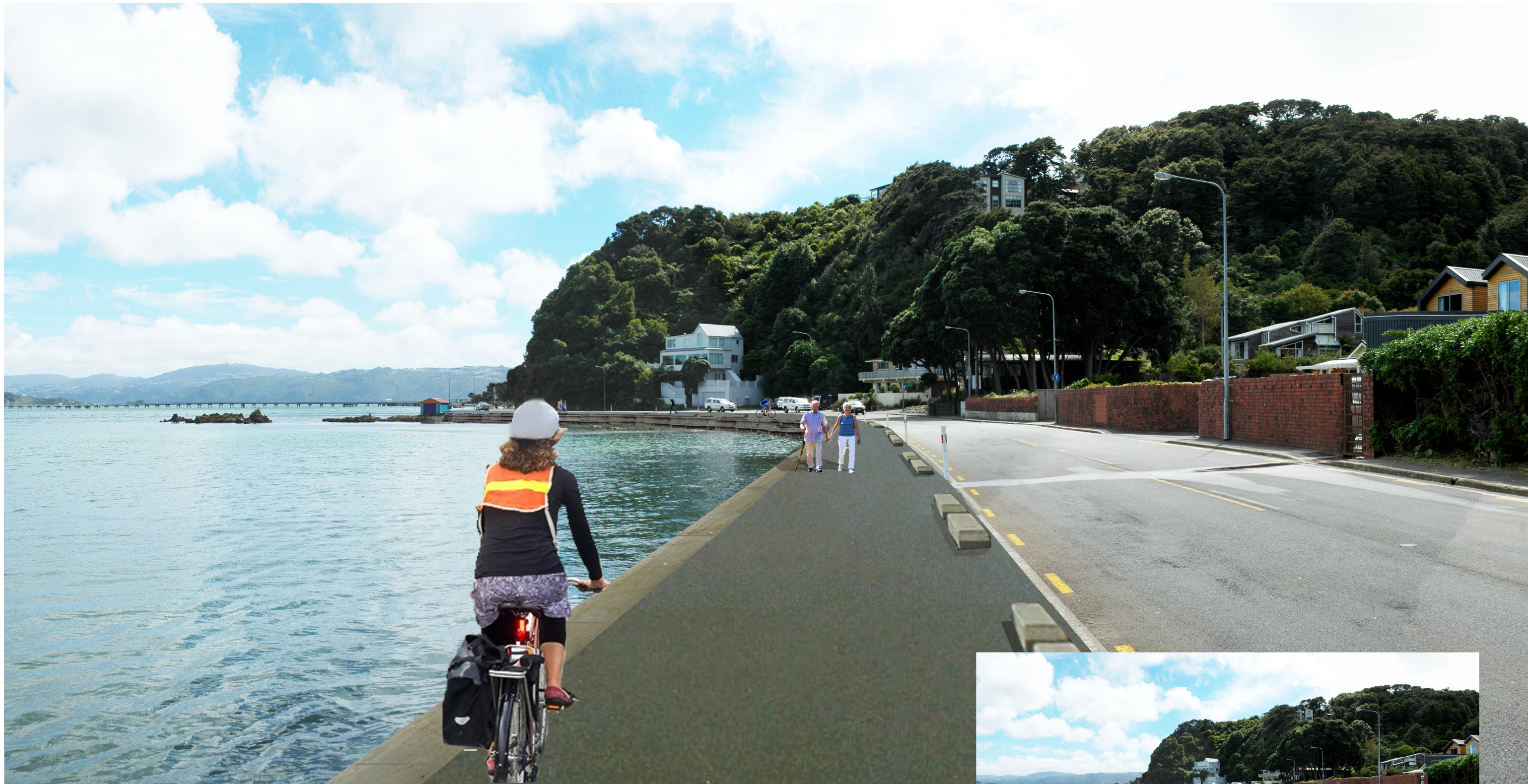
Simulated view of proposed 3.5m wide shared path with double curved wall in Lowry Bay