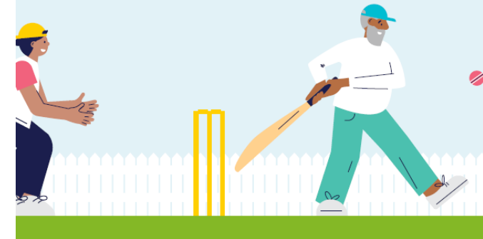
Snapshot of early visuals from our Consultation Document – design in progress