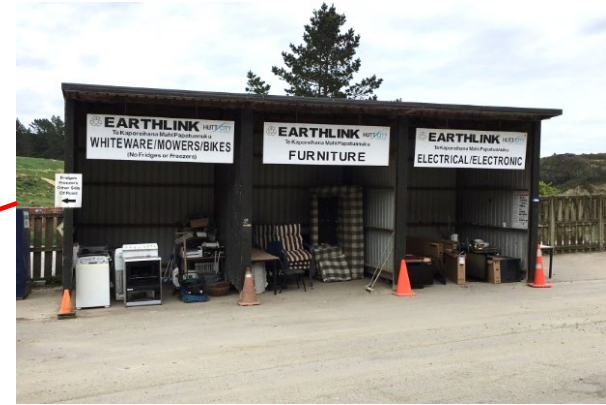
Metal / cardboard drop off