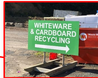
Metal, whiteware, cardboard drop off