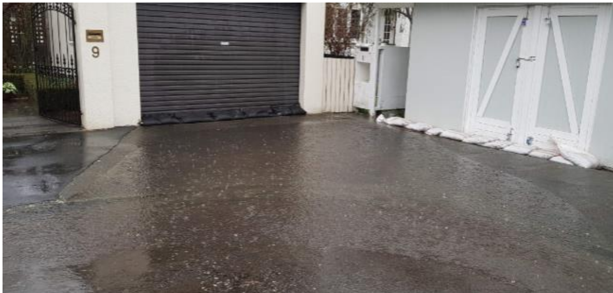
This photo taken on 08 August 2021 shows flooding outside Nos. 9 + 11 Ngaio Street.

In summary: Photos 3 and 4 show flooding across the width of Ngaio Street and pathway at its seaward end. The Karamu / Ngaio Walkway, underneath which a drain across to Karamu Street runs, is on the left-hand side of Photo 3, just to the left of the white car. Clearly, the drain is not working adequately.