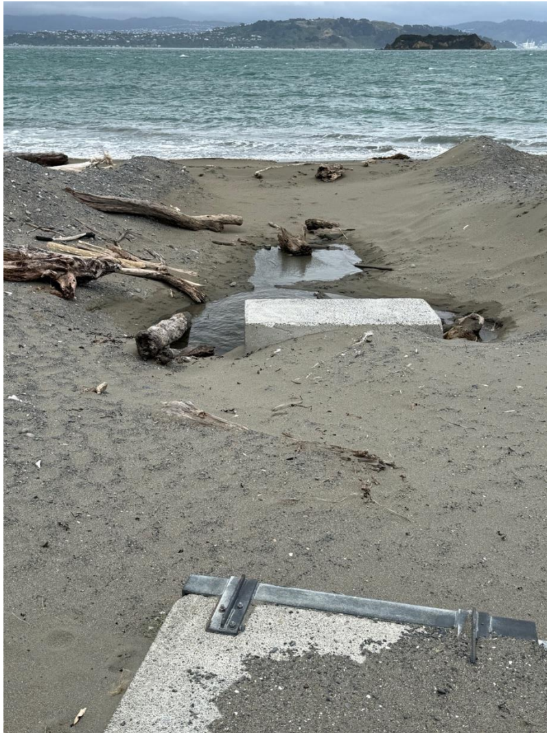
This photo shows the outfall on 18 March 2025