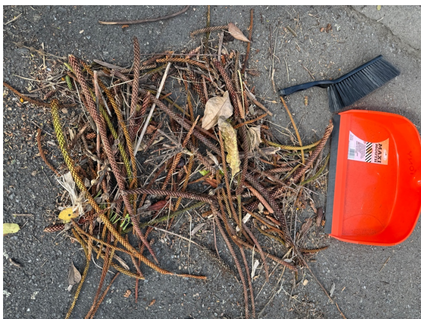
Photo 2. Work in progress