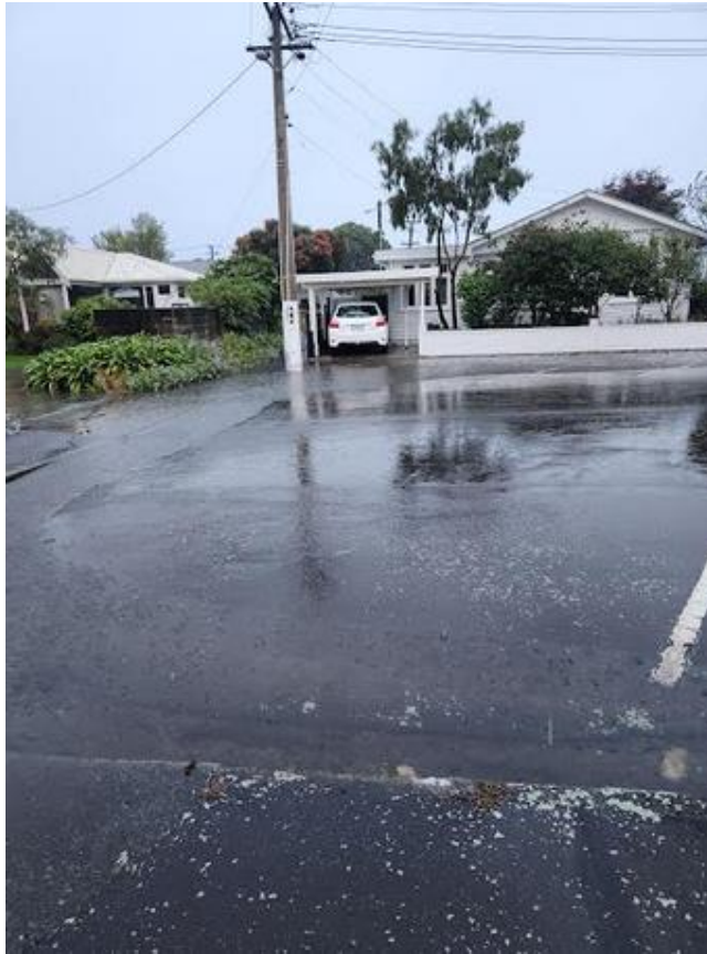
This photo shows end of Ngaio Street covered by water on 03 January 2025.