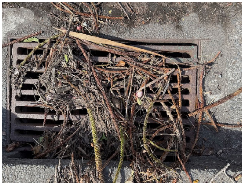
Photo 1. One of two blocked drain gratings at end of street

The three photographs exemplify what I also explain by photographs and commentary in my submission. This is that residents of Ngaio Street like, I know, other residents in Eastbourne, regularly clean the gutters and drainage gratings in their street when needed.