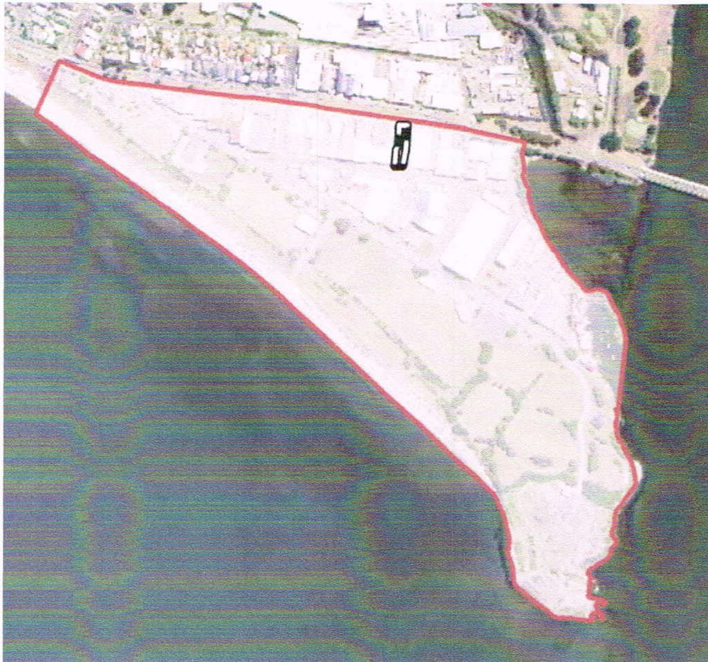
FIGURE 2: Proposed “Site or Area of Significance to Māori - Hikoikoi Pā (Category 2)