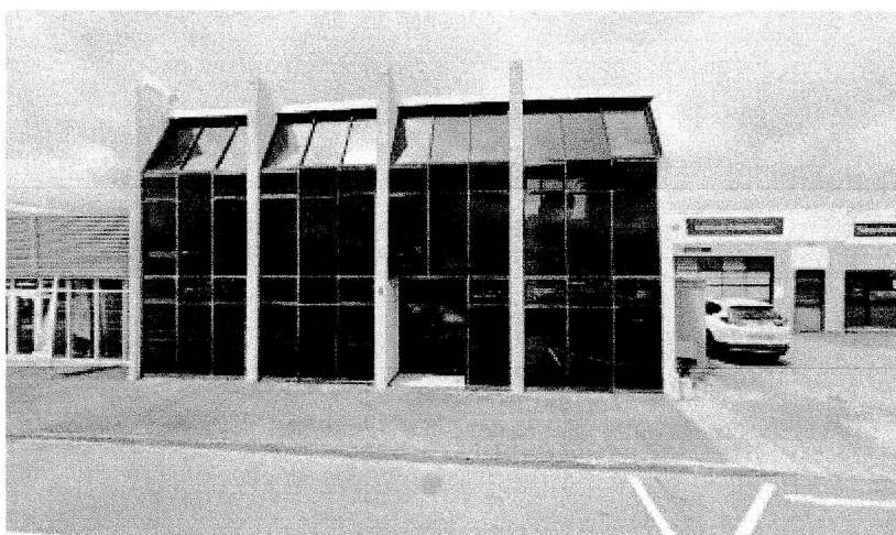
Figure 1: location of 6 Waione st , Petone

[INSERT GOOGLE MAPS IMAGE SHOWING YOUR PROPERTY AMONG SURROUNDING PROPERTIES]