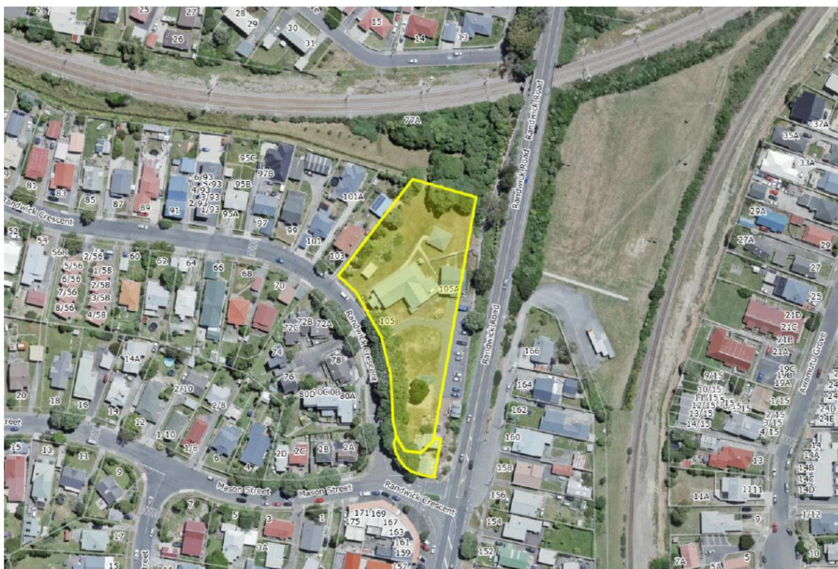
Figure 1: 105-107 Randwick Crescent, Moerā

This submission relates to the site at 105-107 Randwick Crescent, Moerā.