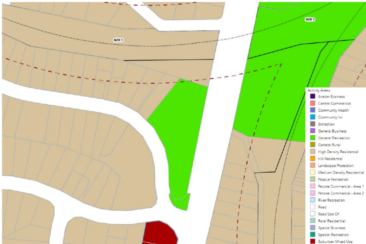
Figure 2: ODP Zones

The operative provisions relating to Natural and Coastal Hazards take a risk based approach and limit development where significant risks cannot be avoided or mitigated.