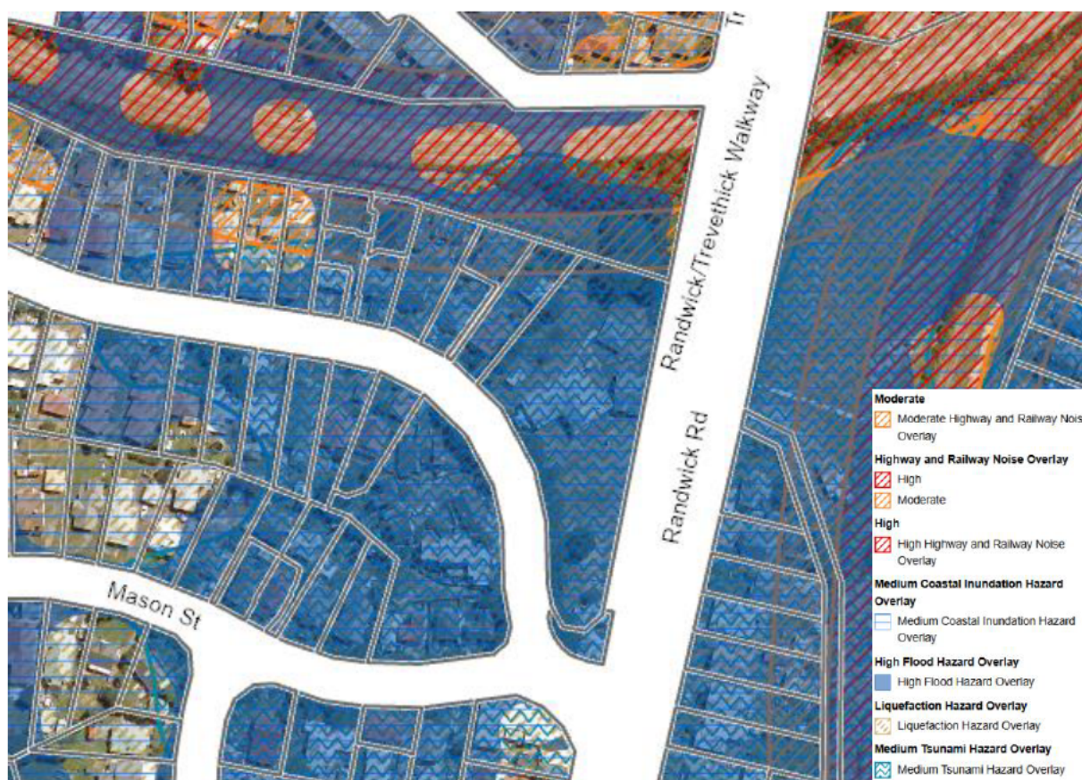
Figure 4: PDP Overlays