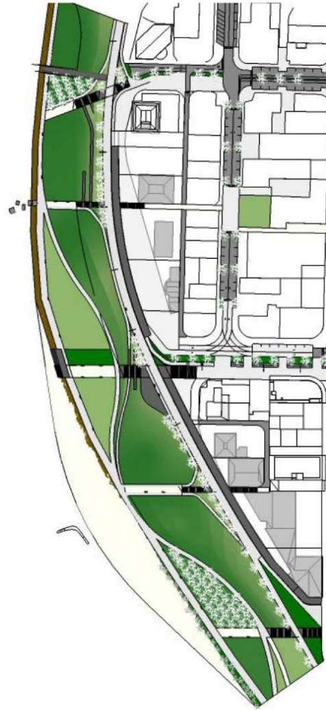
Figure 8.6 Concept landscape design

The challenge now is ensuring these aspirations are consistently carried through into actual development outcomes.