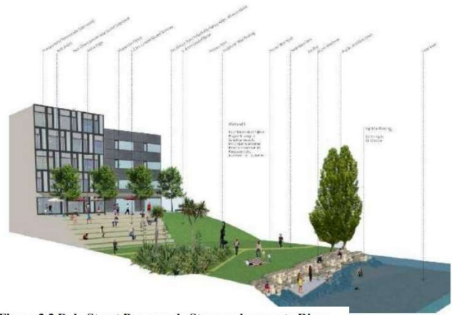
Figure 2.2 Daly Street Promenade Steps and access to River

(Greater Wellington report - Hutt River City Centre Upgrade Report, 2014)