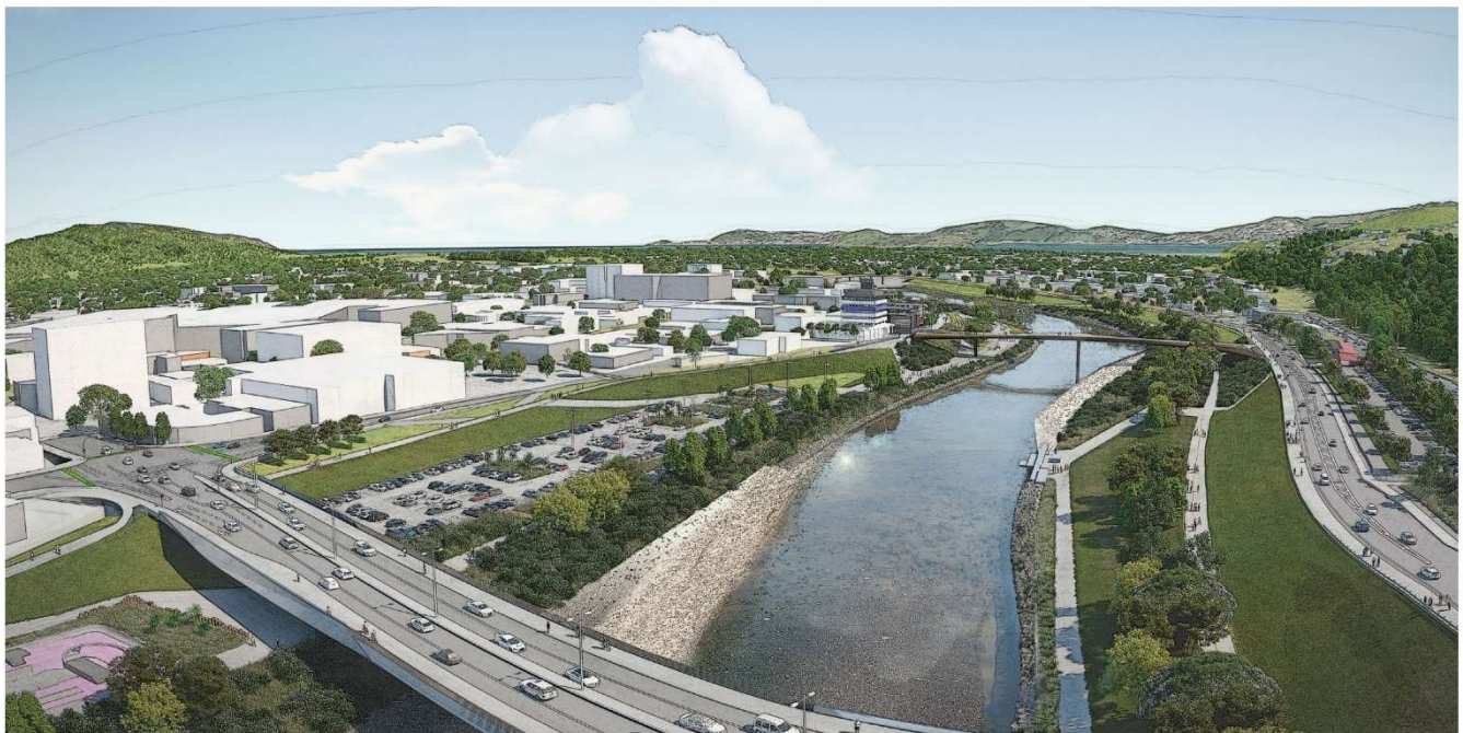
Looking south. Placing the river at the heart of the city. Revegetation of the river corridor to deliver environmental, social and cultural benefits.

While these perspectives demonstrate the scale of opportunity available to the city if development is approached in an integrated and coordinated way.