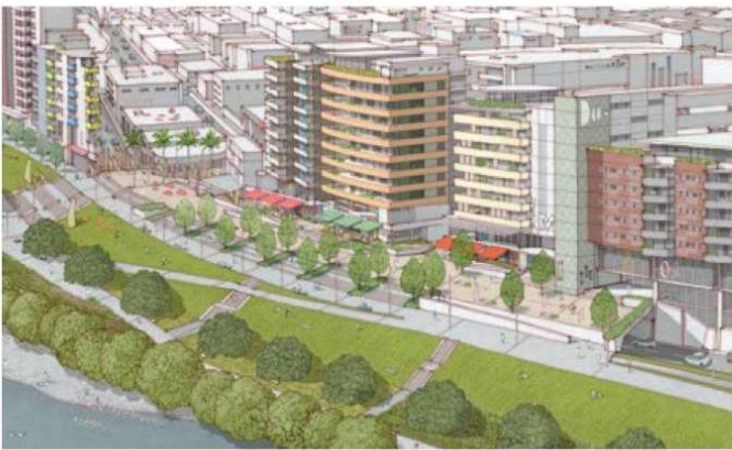
Figure 8.5 Illustrations of Riverlink concept