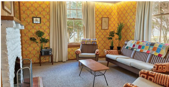
The lounge in the lighthouse keeper's cottage that will open for bookings on 18 August.