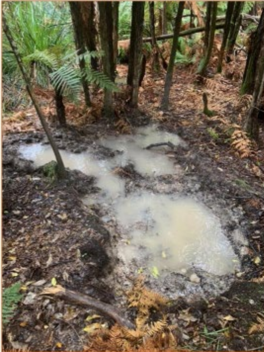
Figure 1 – Wallow used by deer and pigs