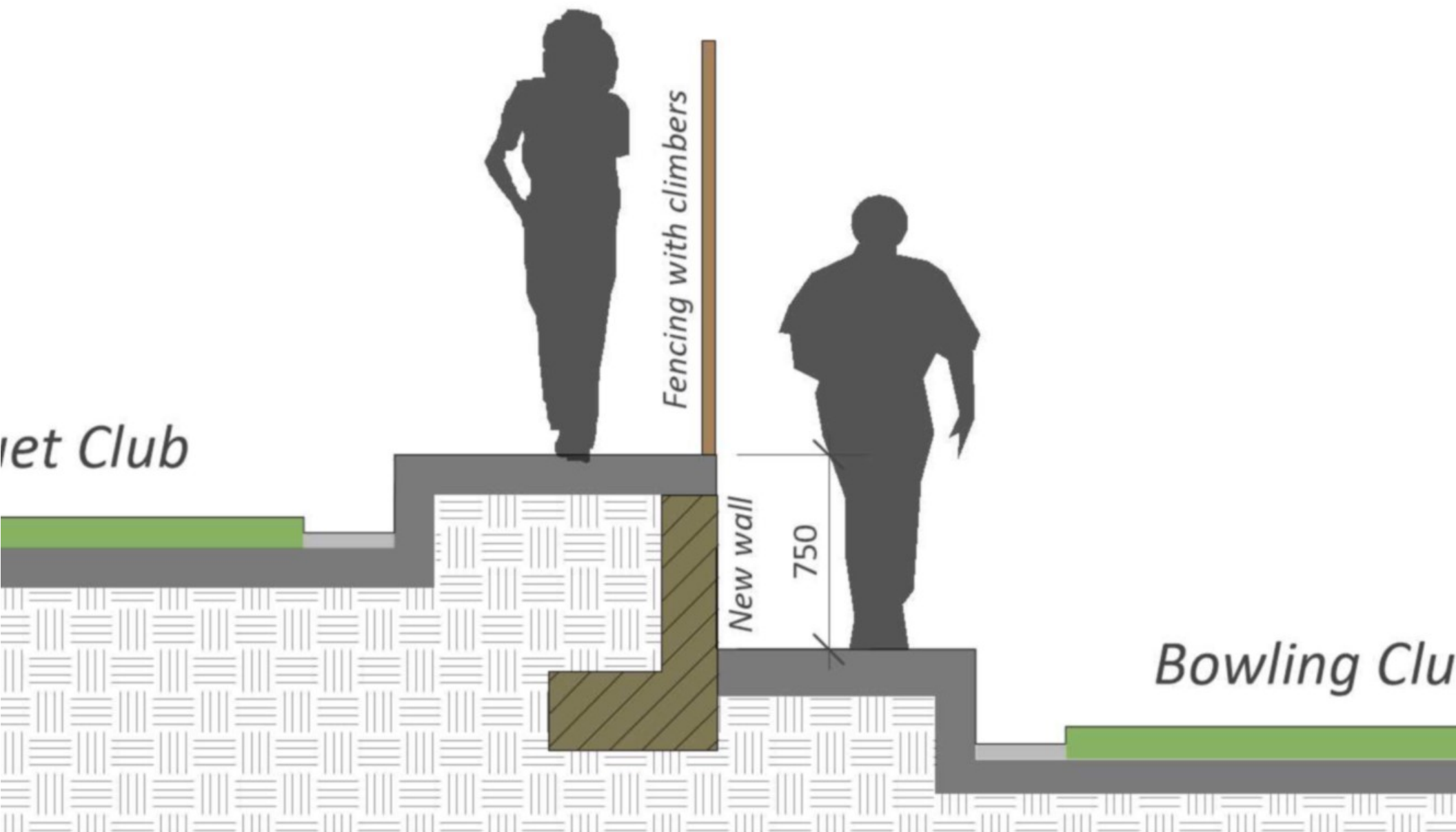
Typical Cross-Section 1:50