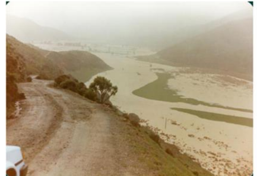
Figure 2 - Flooding in the 2024(L) and 1985 (R) events